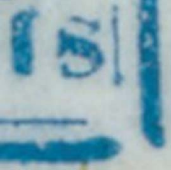
Figure 5. 2¢ “Grinnell” #G50 showing split “s”.