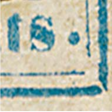
Figure 2. Enlarged area “S’ spur, Genuine #G80.

It would appear that the split “s” is caused by a crease in the paper that this particular stamp was printed on. The pre-printing crease appears to extend beyond the letter “s” to the lower frameline and to the frameline at right as well. This feature is unique to this stamp. This, in effect, could be an example of “DNA proof” that is passed on from the mother, or model to the other “Grinnells”. But let us now examine both the genuine and “Grinnell” 13¢ Type 2s.