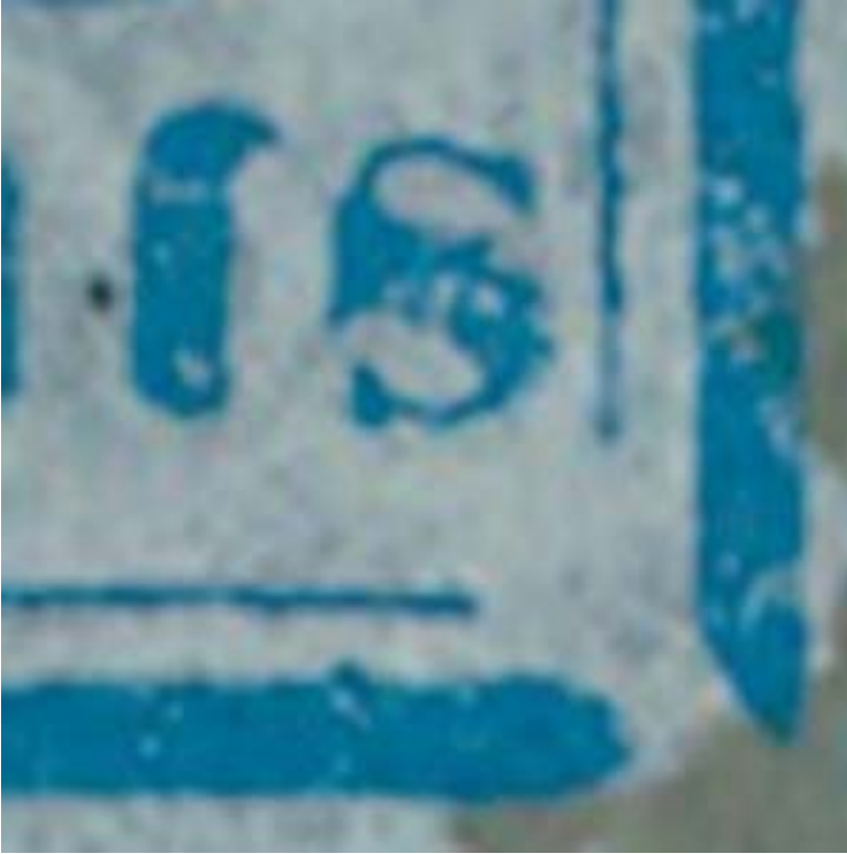
Figure 4. 5¢ “Grinnell” #G19 showing the split “s”. Photo Credit: Arrigo #G19-20.