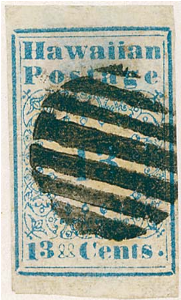
Figure 1. Genuine 13¢ Type 2.

The split "s", is a triangular blue mark that extends from the left central portion of the letter "s" downwards towards a 7 o'clock position. The "s" also shows a line of white (an absence of blue ink) through the "s" and extending towards the 7 o'clock position.