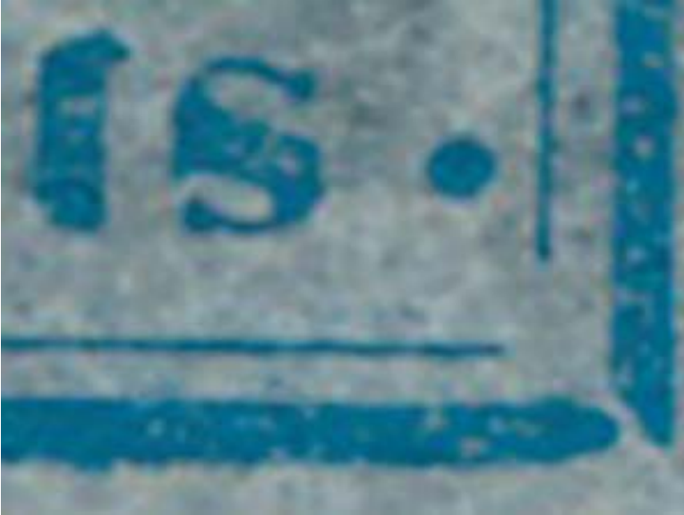
Figure 3. 13¢ “Grinnell” #G30 showing the split “s”.