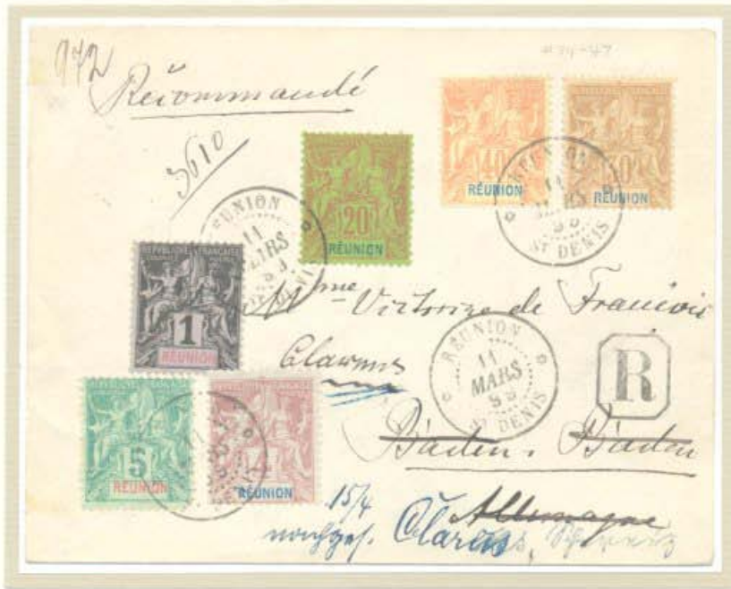
REUNION. The Island of Reunion is located in the Indian Ocean about 400 miles east of the Island of Madagascar. A former French colony until it became an integral part of the Republic of France. Cover above bears the stamps from the first definitive issue postmarked at St. Denis to GERMANY in 1899. Cover below used to Ann Arbor, Michigan from St. Andre in 1914.