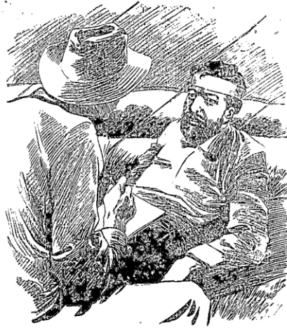
Correspondent Creelman Dictating His Story to W. R. Hearst.

Magnificent Fighting by C Troops as They Rushed Up the Fortified Hill and Drove the Spaniards to Flight.