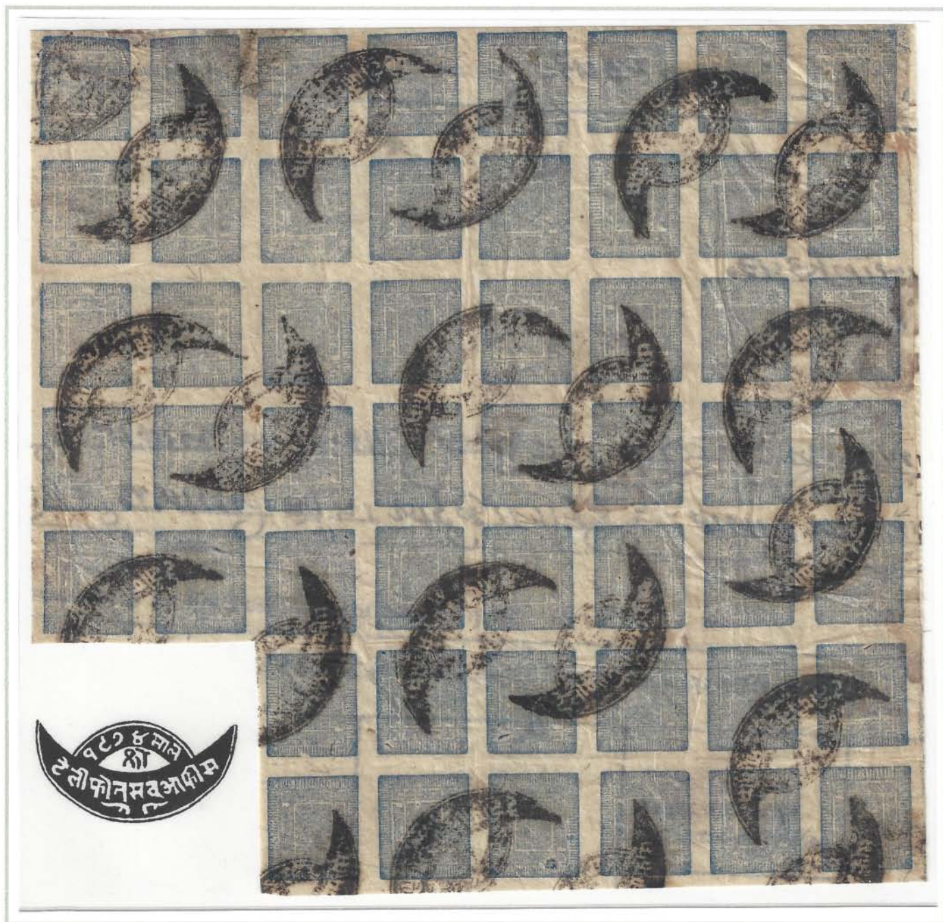
block of 52 from top of sheet (positions 1-40 and 42-48/51-56) affixed to telegraph form used to Kathmandu, Chisapani telegraphic cancels inverted cliché positions: 15, 18, 23, 27, 37, 40 and 51

From a remainder sheet that had been and stored in the Treasury between 1907 and 1917.